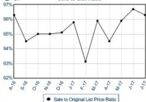
Sold to List Ratio